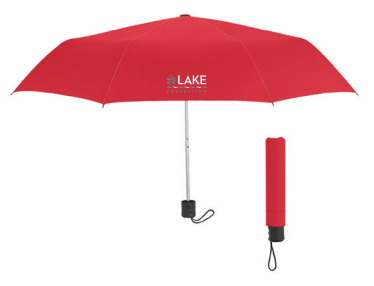
42" Arc Telescopic Umbrella, includes 2 playing positions: $2,650

Tour Divot Tool with Magnetic Marker, includes 2 playing positions: $2,500